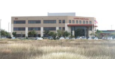
Laurel Park Plaza