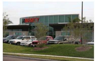
Infinity Call Center