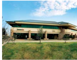
Commerce Center West