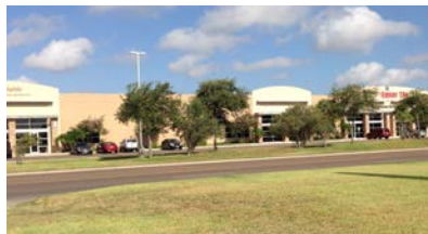
495 Flex Building