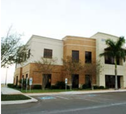
Inter National Ban