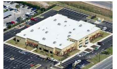
Kika de la Garza Federal Building